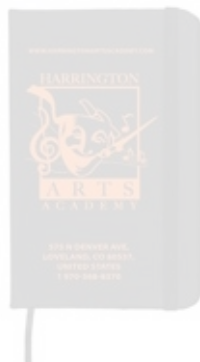
NOTEPAD OPTION 1

SOLD — FTZC™ (FOREIGN-TRADE ZONE CORPORATION)