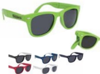
SUNGLASSES OPTION 2 Option 1 plus case