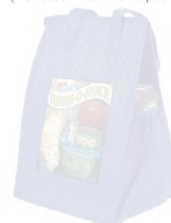
TOTE BAG OPTION 2 (insulated Tote w/ side pocket)