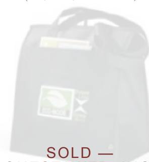
TOTE BAG OPTION 1 (8x8, black, blue or khaki)